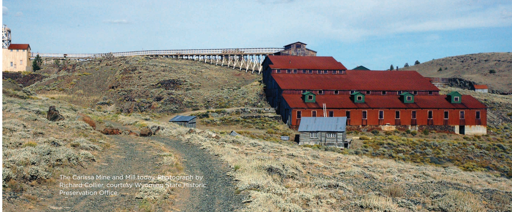
The Carissa Mine and Mill today.

residents formed a historical society aimed at preserving a century of gold mining heritage.