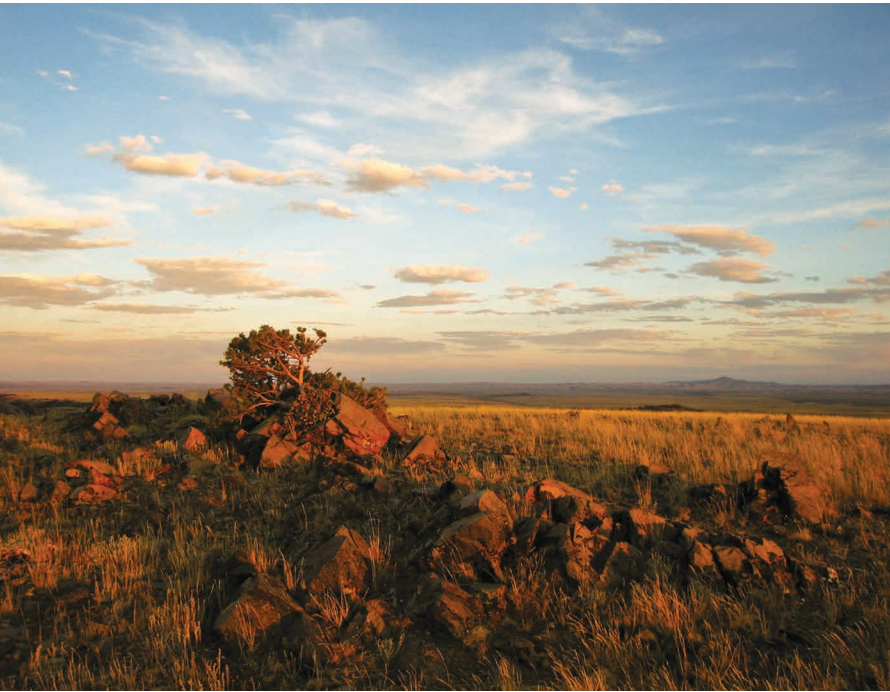
Sunset on South Pass.