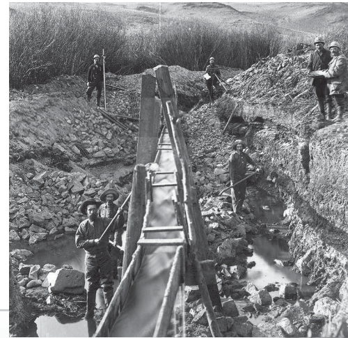
Left: Flumes supplied water to placer (surface) mines in the area. Below: Workers at the Federal Mill at the Carissa.